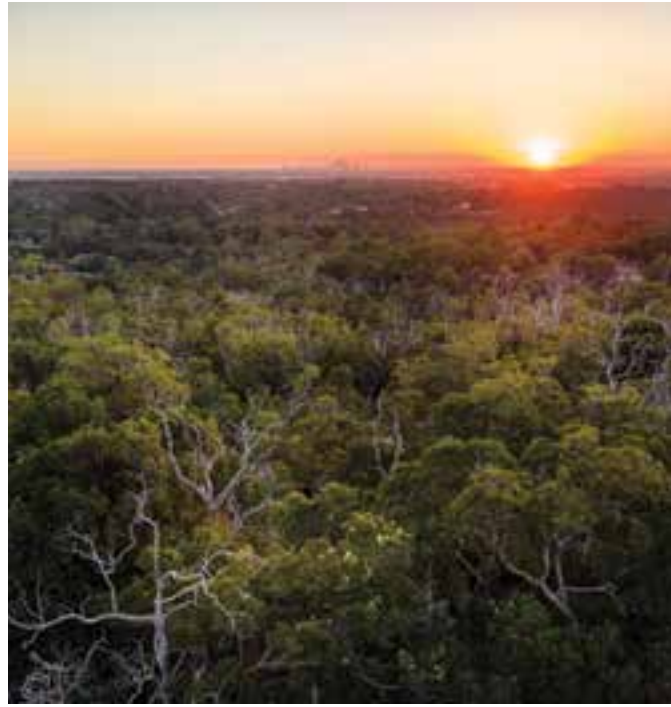
Bushmead - Bushmead (WA)